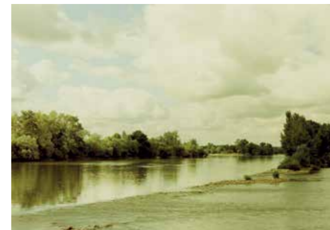
Chouzé-sur-Loire, © Elger Esser

Nocturnes à Giverny , Pôle Image Haute-Normandie, Rouen, France