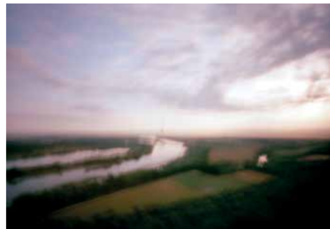
Double page : Sur Loire

His photographic work began in 1970 and for the last twenty or more years he has mostly used a camera obscura (Rigby Pinhole Camera).