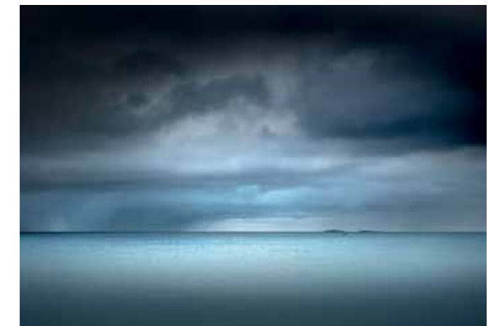
Ciel et Mer