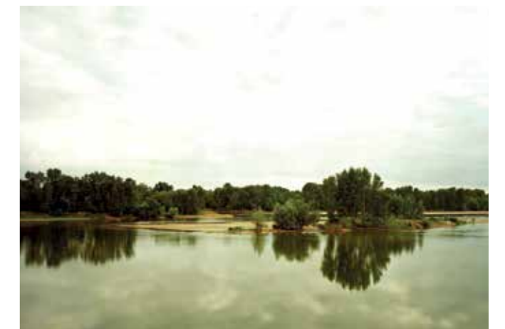
Lair-et-Cher

Arc, Lys et Douville , Neue Heliogravuren, Kunstforum Baloise, Basel, Switzerland