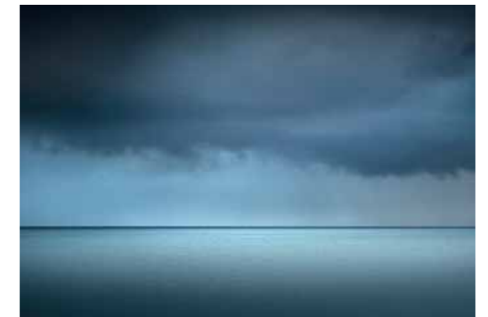
Ciel et Mer

La Chatonnière Azay-Le-Rideau , Éd. privée