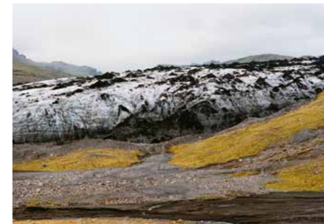
Islande, © Thibaut Cuisset

Thibaut Cuisset , Atelier de Visu, Marseille, France