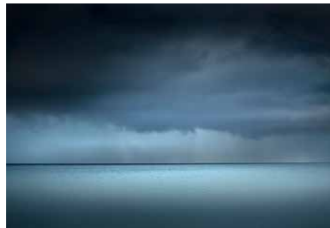
Ciel et Mer

He began his career in 1977, as a photo editor at the GAMMA agency. 6 years later, he took himself off to Los Angeles to cover the American west, and stayed there to work as a photojournalist. He went on to spend 16 years in America, during which he made a speciality of the more out-of-the-ordinary aspects of California.