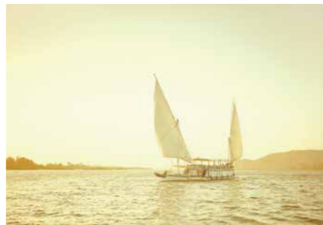
Nil, © Elger Esser