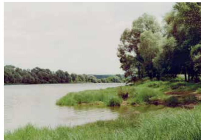
Loire

He won the Treilles Foundation's 2015 Residency Prize for Photography (Paris).